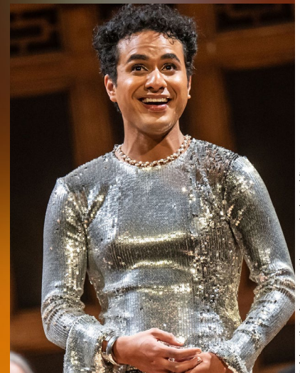
Tafelmusik Performance